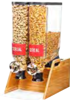
PRO-BULK Bamboo Double 3.5 Gal / 13.3 L ea. 13 x 20.5 x 25 in 33 x 52 x 63.5 cm Clear Acrylic Tray Item # DS103