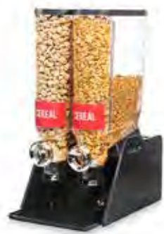
PRO-BULK Black Acrylic Double 3.5 Gal / 13.3 L ea. 13 x 20.5 x 25 in 33 x 52 x 63.5 cm Black Acrylic Tray Item # DS106