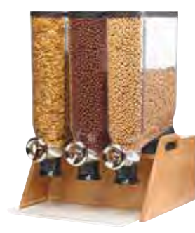
PRO-BULK Dispenser System Triple Table-Top Bamboo Stand with Clear Acrylic Tray 3.5 Gal / 13.3 L ea. 17.7 x 20.5 x 25.4 in 45 x 52 x 63.5 cm Item # DS102