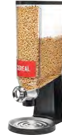
PRO-BULK™ Dispenser System Single Black Table-Top Plastic Stand 3.5 Gal / 13.3 L ea. 9.2 x 13.6 x 24.8 in 23.4 x 34.5 x 63 cm Item # DS100