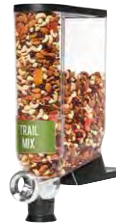
PRO-BULK™ Dispenser System Single Shelf-Mount Kit 3.5 Gal / 13.3 L ea. 5.35 x 16.5 x 17.5 in 13.0 x 41.9 x 44.4 cm Item # DS101

*9 containers fit on 4 ft / 122 cm gondola shelf