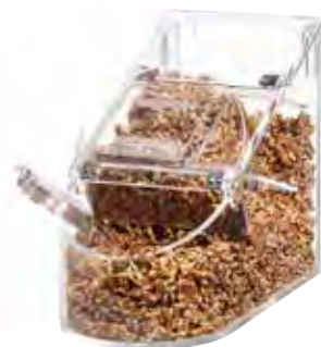
BULKshop™ 3.5 Gallon Acrylic Scoop Bin 3.5 Gal / 13.3 L Capacity 7.8 x 17 x 12.3 in 19.8 x 43.2 x 31.2 cm Item # GD126 (With Scoop) Item # SA126 (Without Scoop)