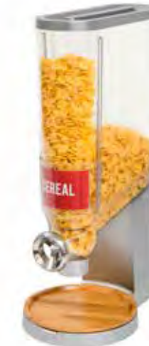
PRO-BULK™ Dispenser System Single Silver Table-Top Plastic Stand 3.5 Gal / 13.3 L ea. 9.2 x 13.6 x 24.8 in 23.4 x 34.5 x 63 cm Item # DS108