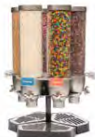
EZ-SERV® 6-Container Carousel Table-Top 1.3 Gal / 4.9 L 20.9 x 20.9 x 27.5 in 53.1 x 53.1 x 69.8 cm Item # EZ563 ▽ ☺