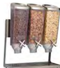
EZ-PRO™ 3 1 Gal / 3.8 L ea. 16 x 8 x 21 in 40.6 x 20.3 x 53.3 cm Item # EZP2135 ▽ ☺