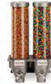
EZ-SERV® 2W 1.3 Gal / 4.94 L ea. 12 x 6.5 x 21 in 30.5 x 16.5 x 53.3 cm Item # EZ524 ▽ ☉