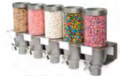
EZ-SERV® 5SW 0.65 Gal / 2.47 L ea. 29 x 7 x 15.25 in 73.7 x 17.8 x 38.7 cm Item # EZ534 ▽ ☉