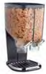
EZ-SERV® 100M (2 Containers) 1.1 Gal / 4.2 L ea. 11 x 8 x 16 in 27.9 x 20.3 x 40.6 cm Item # EZS1074 (metal base) Item # EZS1098 (plastic base) ▽ ☺