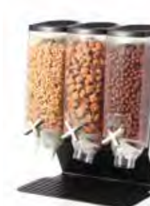
EZ-PRO™ H3B 1 Gal / 3.8 L ea. 14 x 8 x 17 in 35.6 x 20.3 x 43.2 cm Item # EZ50399 ▽ ☺