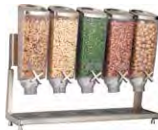
EZ-PRO™ 5 1 Gal / 3.8 L ea. 26 x 8 x 21 in 66 x 20.3 x 53.3 cm Item # EZP2883 ▽ ☺