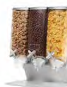
EZ-PRO™ H3G 1 Gal / 3.8 L ea. 14 x 8 x 17 in 35.6 x 20.3 x 43.2 cm Item # EZ566 ▽ ☺