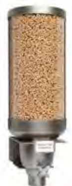
Wall Mount XL EZ-SERV® Dispenser Single, 3.5 Gal / 13.3 L 8.5 x 21 x 28 in 21.6 x 22.9 x 61 cm Item # EZ540 ▽ ☉