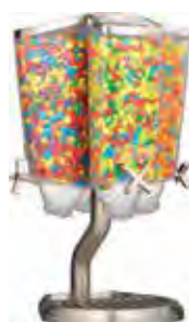
EZ-PRO™ C4L 1 Gal / 3.8 L ea. 14 x 13 x 22 in 35.6 x 33 x 55.9 cm Item # EZP2760 ▽ ☺