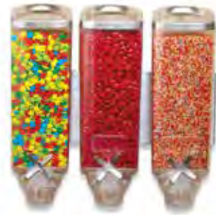
EZ-PRO™ 3W 1 Gal / 3.8 L ea. 15.5 x 7.75 x 15 in 39.4 x 19.7 x 38.1 cm ▽ ☉ Item # EZP2906 Item # EZP2906-N