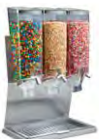
EZ-PRO™ T3 1 Gal / 3.8 L ea. 19 x 10 x 16 in 48.2 x 25.4 x 40.6 cm Item # EZ51377 Item # EZPROT3-N ▽ ☺