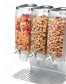
EZ-PRO™ H3S 1 Gal / 3.8 L ea. 14 x 8 x 17 in 35.6 x 20.3 x 43.2 cm Item # EZ515 ▽ ☺