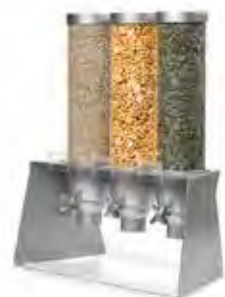
EZ-SERV® Three-Container Table Top with Grey Metal Stand 1.3 Gal / 4.9 L 18 x 13.5 x 26.5 in 45.7 x 34.3 x 67.3 cm Item # EZ564 ▽ ☺