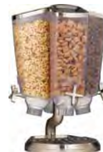
EZ-PRO™ C4S 1 Gal / 3.8 L ea. 13 x 14 x 19 in 33 x 35.6 x 48.3 cm Item # EZP2753 ▽ ☺