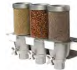
EZ-SERV® 3SW 0.65 Gal / 2.47 L ea. 17.8 x 7 x 15.25 in 45.2 x 17.8 x 38.7 cm Item # EZ533 ▽ ☉