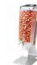
EZ-PRO™ H1S 1 Gal / 3.8 L 6 x 8 x 17 in 38.1 x 25.4 x 53.3 cm Item # EZ513 ▽ ☺