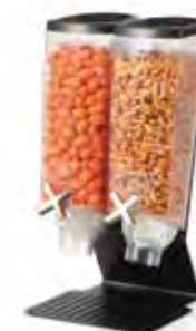
EZ-PRO™ H2B 1 Gal / 3.8 L ea. 9 x 8 x 17 in 22.9 x 20.3 x 43.2 cm Item # EZ50299 ▽ ☺