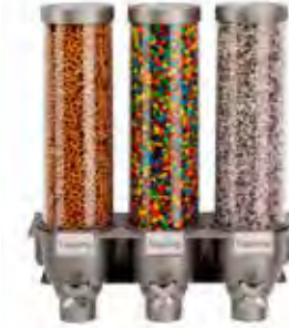
EZ-SERV® 3W 1.3 Gal. / 4.94 L ea. 17.8 x 6.5 x 21 in 45.2 x 16.5 x 53.3 cm Item # EZ525 ▽ ☉

All Containers Include 6 PORTION CONTROL WHEELS ranging from 1 teaspoon to 4.5 teaspoons. Exact measuring saves on food cost!