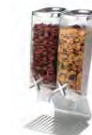
EZ-PRO™ H2S 1 Gal / 3.8 L ea. 9 x 8 x 17 in 22.9 x 20.3 x 43.2 cm Item # EZ514 ▽ ☺