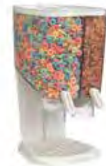
EZ-SERV® 200M (2 Containers) 1.1 Gal / 4.2 L ea. 11 x 8 x 16 in 27.9 x 20.3 x 40.6 cm Item # EZS1081 (metal base) Item # EZS1104 (plastic base) ▽ ☺