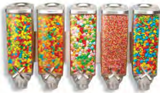
EZ-PRO™ 5W 1 Gal / 3.8 L ea. 26 x 7.75 x 15 in 66 x 19.7 x 38.1 cm ▽ ☉ Item # EZP2890 Item # EZP2890-N

All Containers Include 6 PORTION CONTROL WHEELS ranging from 1 teaspoon to 4.5 teaspoons. Exact measuring saves on food cost!