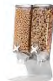
EZ-PRO™ H2G 1 Gal / 3.8 L ea. 9.19 x 8.13 x 17.19 in 23.3 x 20.6 x 43.7 cm Item # EZ565 ▽ ☺