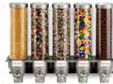
EZ-SERV® 5W 1.3 Ga / 4.94 L ea. 29 x 6.5 x 21 in 73.7 x 16.5 x 53.3 cm Item # EZ527 ▽ ☉