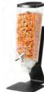
EZ-PRO™ H1B 1 Gal / 3.8 L 6 x 8 x 17 in 15.2 x 20.3 x 43.2 cm Item # EZ50199 ▽ ☺