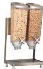
EZ-PRO™ 2 1 Gal / 3.8 L 10 x 8 x 21 in 25.4 x 20.3 x 53.3 cm Item # EZP2746 ▽ ☺