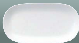
9795-9398 OVAL DISH, SMALL L178mm/S95mm/H19mm