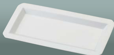
702 RECTANGLE TRAY L232mm/S108mm/H17mm