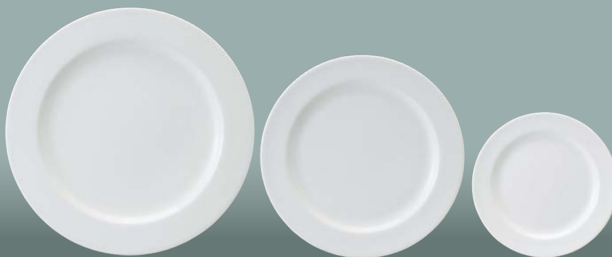
5250 25cm PLATE D252mm/H17mm

Narumi's in-flight tableware meets the standards required and expected by the airline industry. It is the result of a substantial investigation into the needs of in-flight services worldwide. This fine bone china exhibits practical points: weight, durability, passenger acceptance, handling, compliance with international safety standards. All of these features are attainable at the best cost, making your choice for Narumi chinaware an unbeatable option.