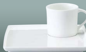
50481-2634 ESPRESSO CUP L80mm/S60mm/H55mm/100cc 50481-3580 FLAT SAUCER FOR ESPRESSO CUP L148mm/S148mm/H14mm