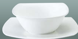
50481-2824 13cm SQUARE SOUP BOWL D156mm/L136mm/S136mm/H53mm