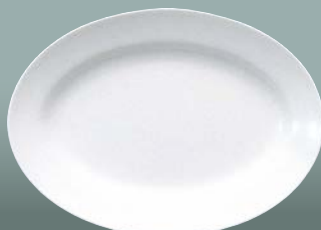
92626-1761 25cm OVAL RIM PLATTER L254mm/S193mm/H30mm