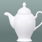
92626-4461V VINEGAR CONTAINER L107mm/S58mm H105mm/110cc