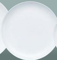
92626-1224 19cm ROUND COUPE PLATE D193mm/H21mm