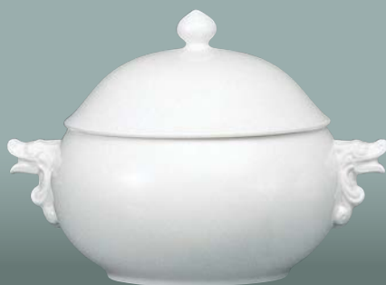
92626-3212 SOUP TUREEN(L) L332mm/S254mm H228mm/4,700cc