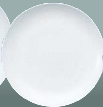
92626-1225 16cm ROUND COUPE PLATE D167mm/H17mm