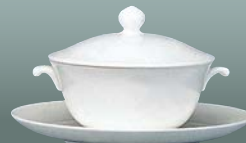
92626-3268 SOUP CUP W/COVER(L) L142mm/S121mm/H93mm/340cc