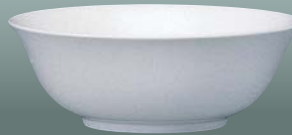
92626-3294 23cm SOUP BOWL D232mm/H82mm/1,990cc