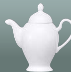
92626-4461R OIL CONTAINER L107mm/S58mm H105mm/110cc