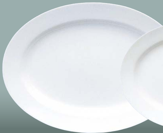
92626-1757 47cm OVAL RIM PLATTER L475mm/S345mm/H46mm