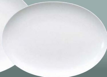
92626-1538 30cm OVAL COUPE PLATTER L309mm/S227mm/H26mm