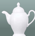
92626-4461S SOYA CONTAINER L107mm/S58mm H105mm/110cc