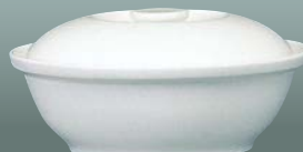
92626-3303 CASSEROLE W/ COVER(6-P) D223mm/H99mm/1,240cc