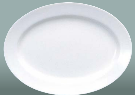
92626-1759 35cm OVAL RIM PLATTER L357mm/S262mm/H37mm