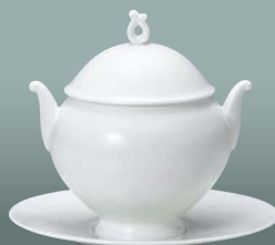
92626-3601 SOUP BOWL W/COVER 570cc L150mm/S121mm/H147mm/570cc