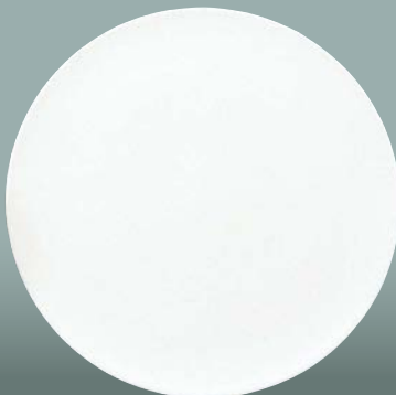
9265-1986 29cm FLAT PLATE D288mm/H17mm