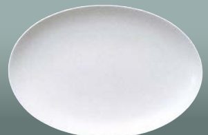
92626-1540 23cm OVAL COUPE PLATTER L235mm/S159mm/H23mm