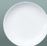
92626-1313 12cm ROUND COUPE PLATE D128mm/H18mm