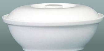
92626-3387 CASSEROLE W/ COVER(12-P) D270mm/H136mm/3,140cc