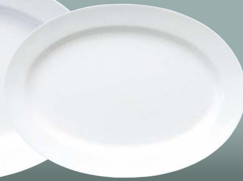
92626-1802 40cm OVAL RIM PLATTER L405mm/S288mm/H42mm