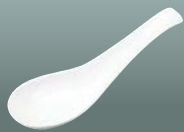
92626-9321 SPOON(L) L138mm/S45mm H50mm