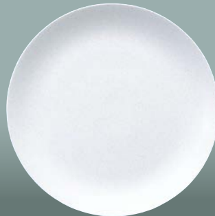
92626-1598 25cm ROUND COUPE PLATE D256mm/H26mm