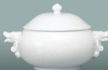
92626-3225 SOUP TUREEN(S) L292mm/S215mm H179mm/2,830cc