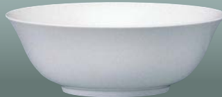
92626-3293 25cm SOUP BOWL D252mm/H90mm/2,500cc