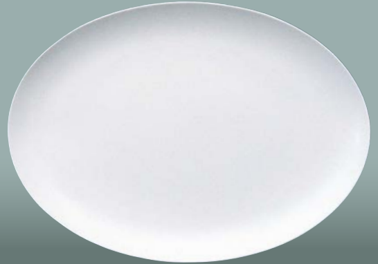
92626-1230 43cm OVAL COUPE PLATTER L438mm/S316mm/H33mm