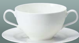
92626-2886 SOUP CUP L178mm/S124mm/H74mm/540cc