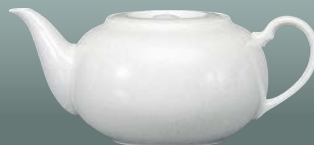
92626-4337 CHINESE TEA POT(M) L232mm/S149mm/H99mm 1,060cc