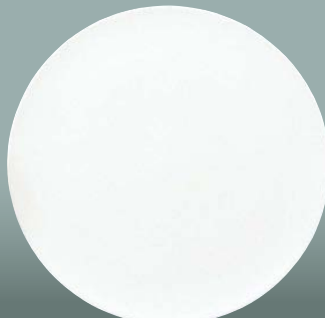
92626-1866 26cm FLAT PLATE D259mm/H14mm