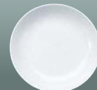
92626-1597 10cm ROUND COUPE PLATE D103mm/H21mm