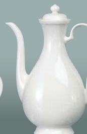
92626-4266 SAMSHU POT(L) L135mm/S73mm/H189mm 400cc