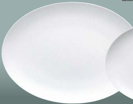
92626-1231 38cm OVAL COUPE PLATTER L384mm/S275mm/H31mm