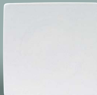
92626-5270 27cm SQUARE PLATE L275mm/S275mm/H 29mm