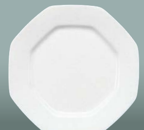
92626-1524 22cm OCTAGONAL PLATE L228mm/S218mm/H19mm