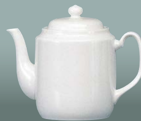
92626-4295 CHINESE TEA POT(S) L200mm/S119mm/H163mm 1,130cc