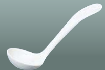
9265-9453 LADLE L172mm/S63mm