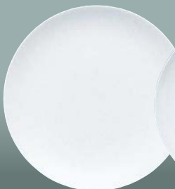
92626-1643 21cm ROUND COUPE PLATE D213mm/H21mm