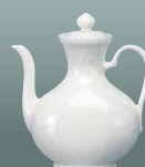
92626-4267R(辣油) 92626-4267RE(O) OIL CONTAINER L90mm/S73mm H102mm/120cc