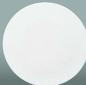
92626-1102 23cm FLAT PLATE D230mm/H8mm