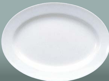
92626-1760 30cm OVAL RIM PLATTER L305mm/S220mm/H32mm