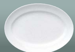
92626-1881 18cm OVAL RIM PLATTER L180mm/S130mm/H24mm