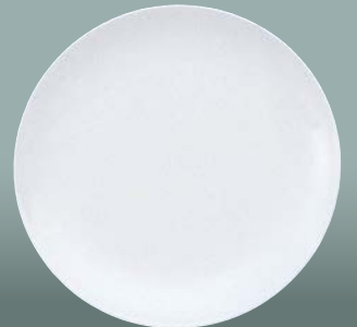
92626-1288 23cm ROUND COUPE PLATE D228mm/H22mm