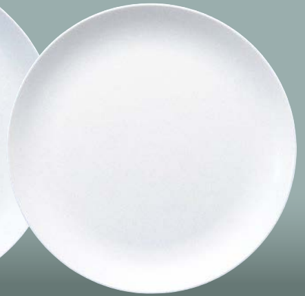
92626-1537 35cm ROUND COUPE PLATE D344mm/H32mm