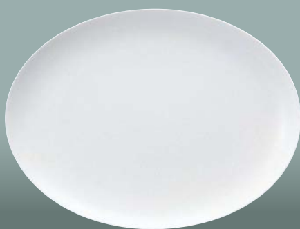
92626-1877 35cm DEEP OVAL PLATTER L354mm/S263mm/H29mm