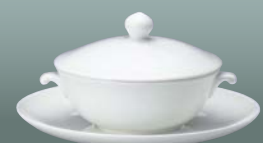
92626-3328 SOUP CUP W/COVER(S) L142mm/S121mm H62mm/300cc