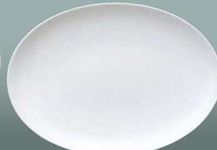
92626-1539 25cm OVAL COUPE PLATTER L258mm/S185mm/H27mm