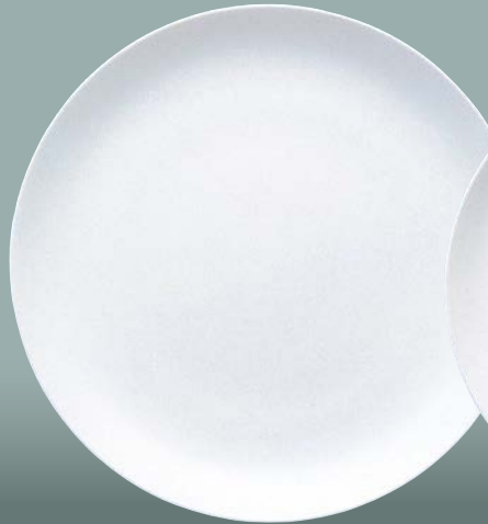
92626-1074 38cm ROUND COUPE PLATE D385mm/H38mm