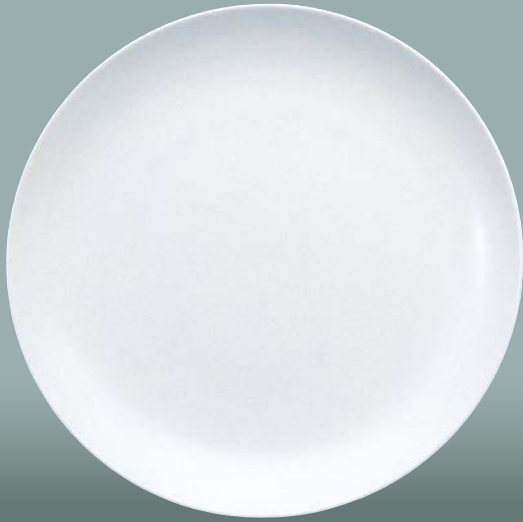
92626-1536 42cm ROUND COUPE PLATE D426mm/H43mm

Modi ed to reinforce the maximum thickness of the body with rolled and reinforced edges (★items marked), this collection exhibits the highest standards of durability and edge chipping resistance that are demanded by the operating pressures of the busiest catering establishment.