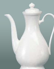
92626-4313 SAMSHU POT(S) L127mm/S66mm/H157mm 240cc