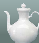
92626-4267V(醋) 92626-4267VC(醋) 92626-4267VE(V) VINEGAR CONTAINER L90mm/S73mm H102mm/120cc