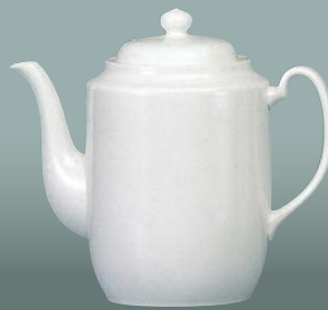
92626-4294 CHINESE TEA POT(L) L212mm/S121mm/H194mm 1,570cc