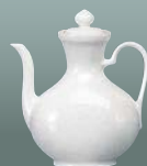
92626-4267S(醬油) 92626-4267SC(醬油) 92626-4267SE(S) SOYA CONTAINER L90mm/S73mm H102mm/120cc