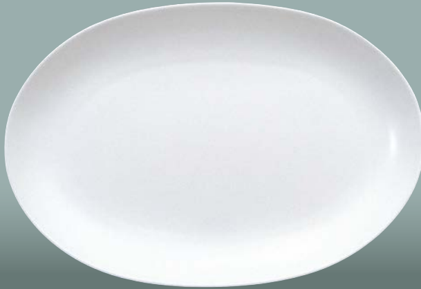
92626-1063 50cm OVAL COUPE PLATTER L505mm/S345mm/H43mm

Modified to reinforce the maximum thickness of the body with rolled and reinforced edges (★ items marked), this collection exhibits the highest standards of durability and edge chipping resistance that are demanded by the operating pressures of the busiest catering establishment.