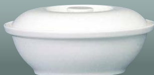
92626-3255 CASSEROLE W/ COVER(10-P) D246mm/H108mm/1,700cc