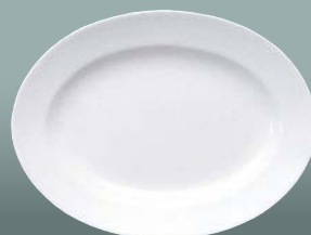
92626-1042 23cm OVAL RIM PLATTER L229mm/S172mm/H27mm