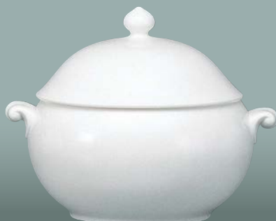
92626-3286 SOUP TUREEN(L) L303mm/S254mm/H228mm/4,700cc