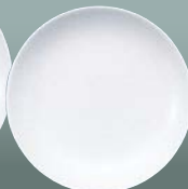
92626-1599 14cm ROUND COUPE PLATE D139mm/H20mm