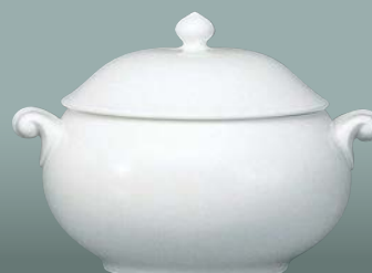
92626-3288 SOUP TUREEN(S) L252mm/S215mm/H179mm/2,830cc