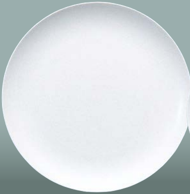
92626-1232 31cm ROUND COUPE PLATE D309mm/H32mm